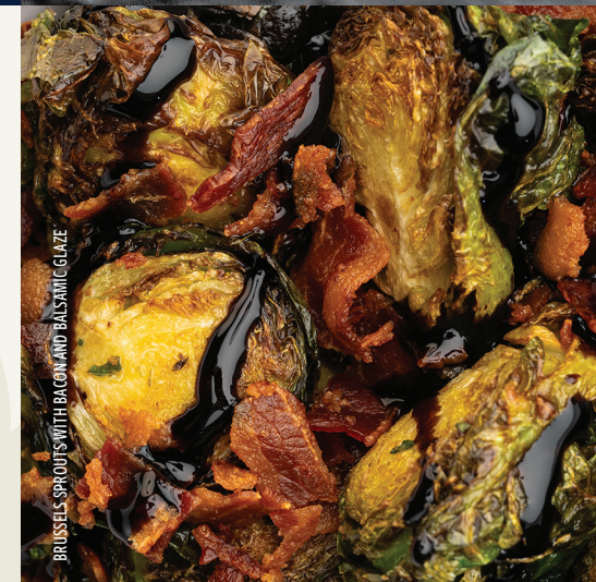
BRUSSELS SPROUTS WITH BACON AND BALSAMIC GLAZE