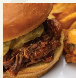
PULLED PORK SANDWICH

A half-pound beef patty from Ferry Farms topped with lettuce, tomato, pickles, and red onion. Add bacon for $1.49. Add cheese, sautéed onions and/or sautéed mushrooms for .49 each | Upgrade to a Bison Burger for an additional $5 $10.99