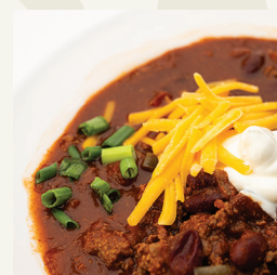
HOUSEMADE BISON CHILI