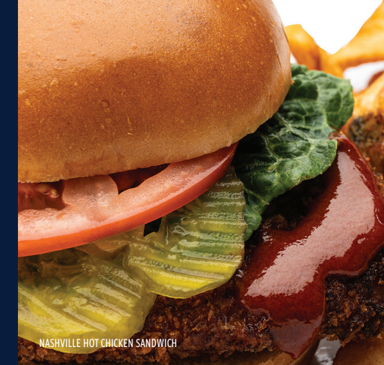
NASHVILLE HOT CHICKEN SANDWICH

Coke, Diet Coke, Sprite, Dr. Pepper, Ginger Ale, Iced Tea, Lemonade (unlimited refills) $2.79 Coffee/Hot Tea $1.99 ..... See the separate drink menu for wine and beer list and spirit offerings