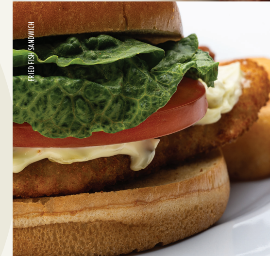
FRIED FISH SANDWICH