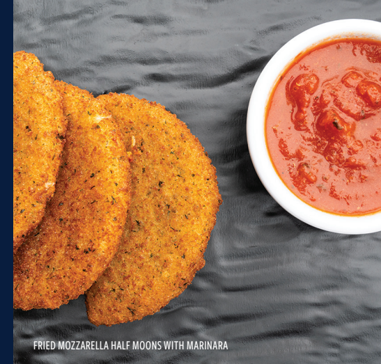
FRIED MOZZARELLA HALF MOONS WITH MARINARA