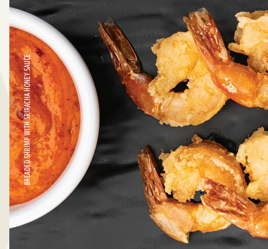
BREADED SHRIMP WITH SRIRACHA HONEY SAUCE