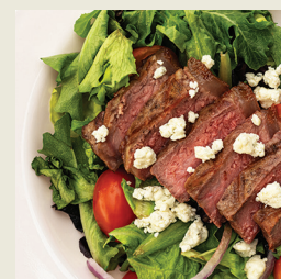
BLACK AND BLUE SALAD