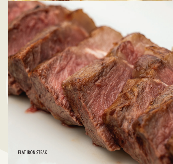
FLAT IRON STEAK