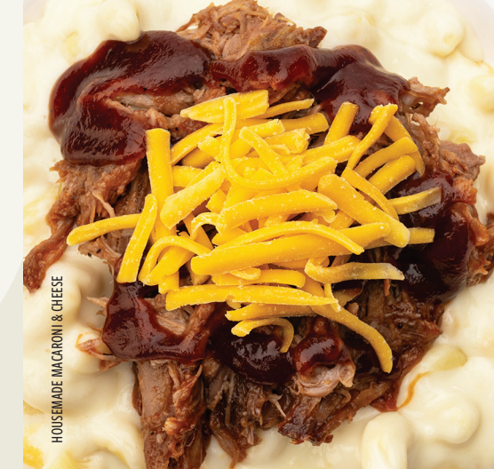
HOUSEMADE MACARONI & CHEESE

Seasonal Vegetables $2.99 Cole Slaw $2.99 Cottage Cheese $2.99 Cornbread $2.99