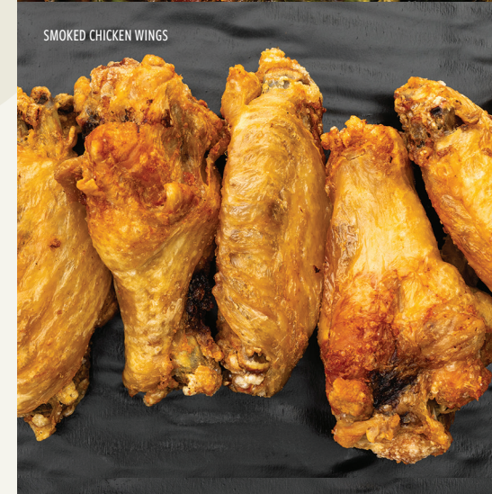
SMOKED CHICKEN WINGS